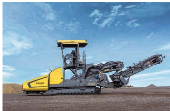
Everything in view – the lift platform offers the best overview.