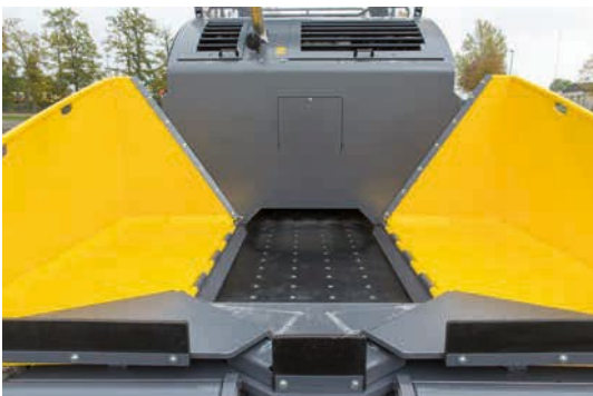
Prevent demixing – 1.20 m width ensures smooth material transport.