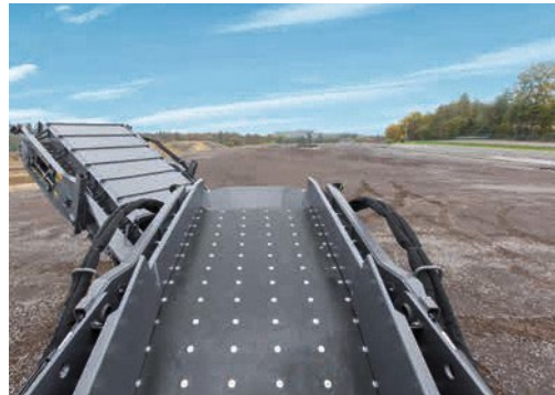
Flexible in use – the optionally available swivel belt with 6.5 m (OC 650) for BMF 2500 S.