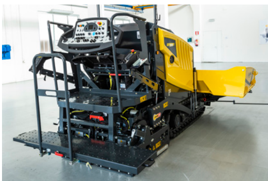
Two level platform concept - best view without compromises.