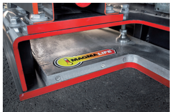
Heats up nearly 60 % quicker – unique MAGMALIFE heating system.