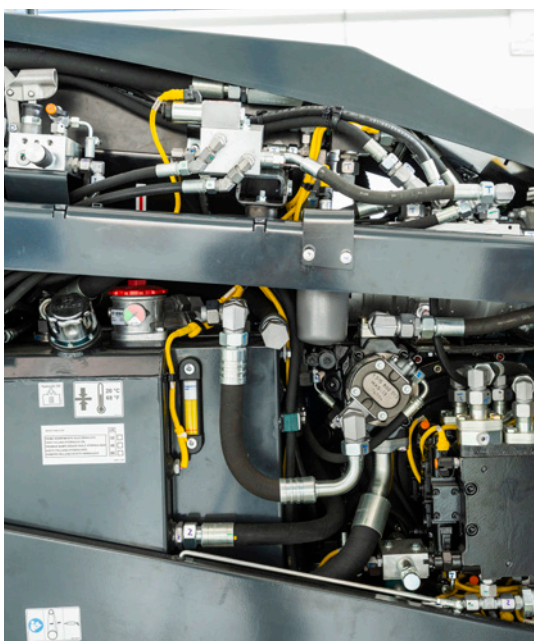
Save up to 20 % fuel – demand-driven hydraulics – with BOMAG ECOMODE.