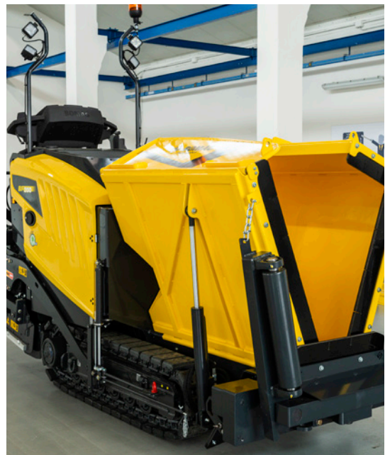
Compact and agile - unique recipe for full flexibility.